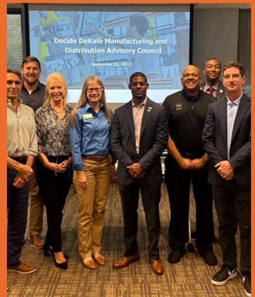
MANUFACTURING & LOGISTICS COUNCIL