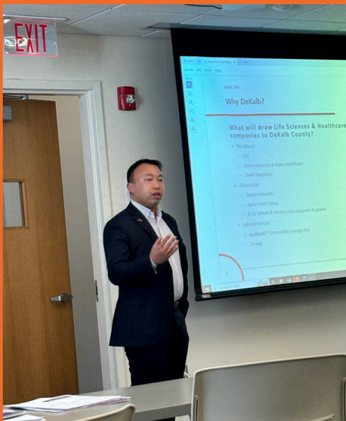
HEALTHCARE & LIFE SCIENCES COUNCIL

Complementing these targeted industry Councils is Advocate DeKalb, which fosters a collaborative exchange between Decide DeKalb and an interdisciplinary group of advisors, serving as a platform for shared learning and mutual feedback.